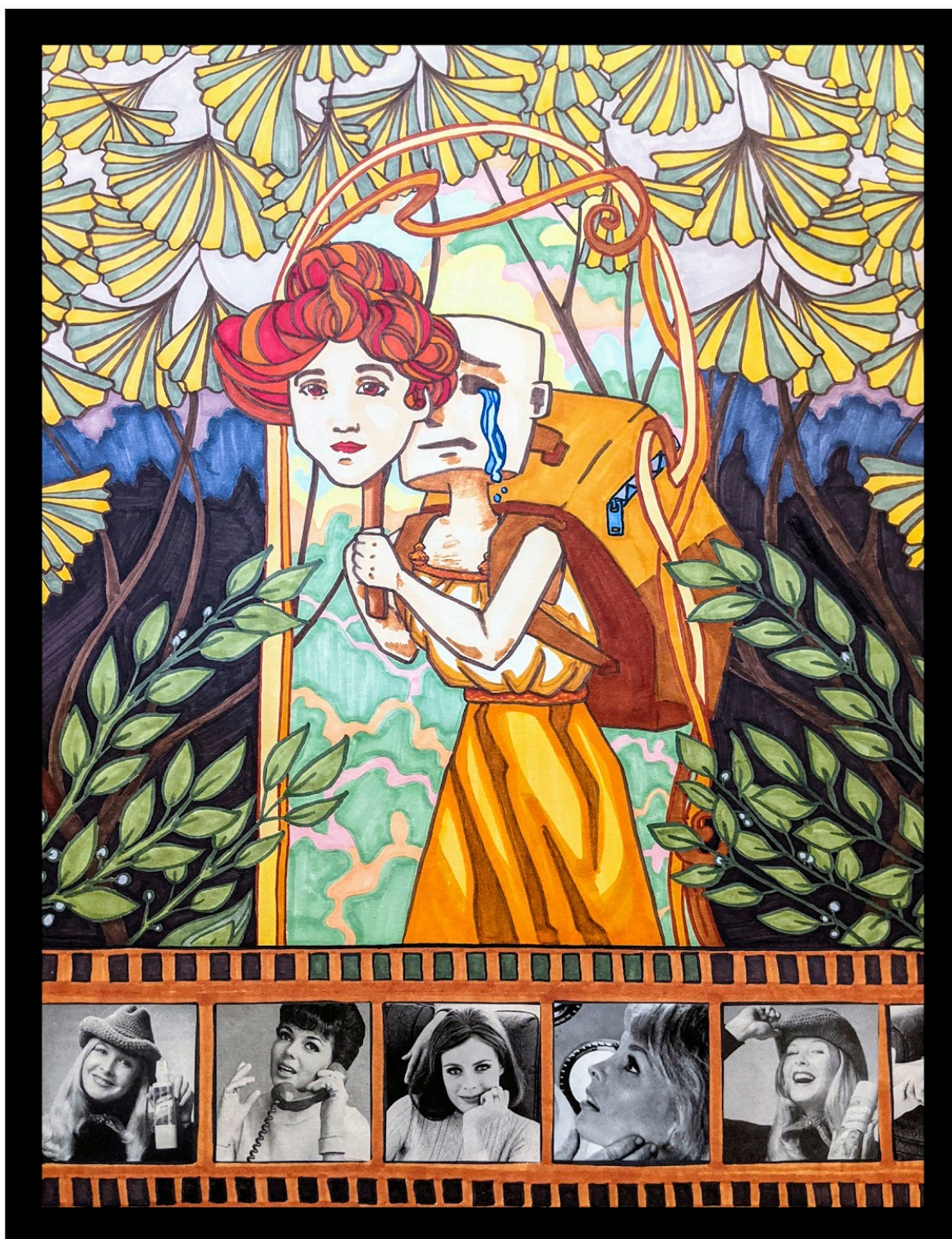
Ember Estridge, Nothing to See Here , Mixed Media, 18"x 24", 2020