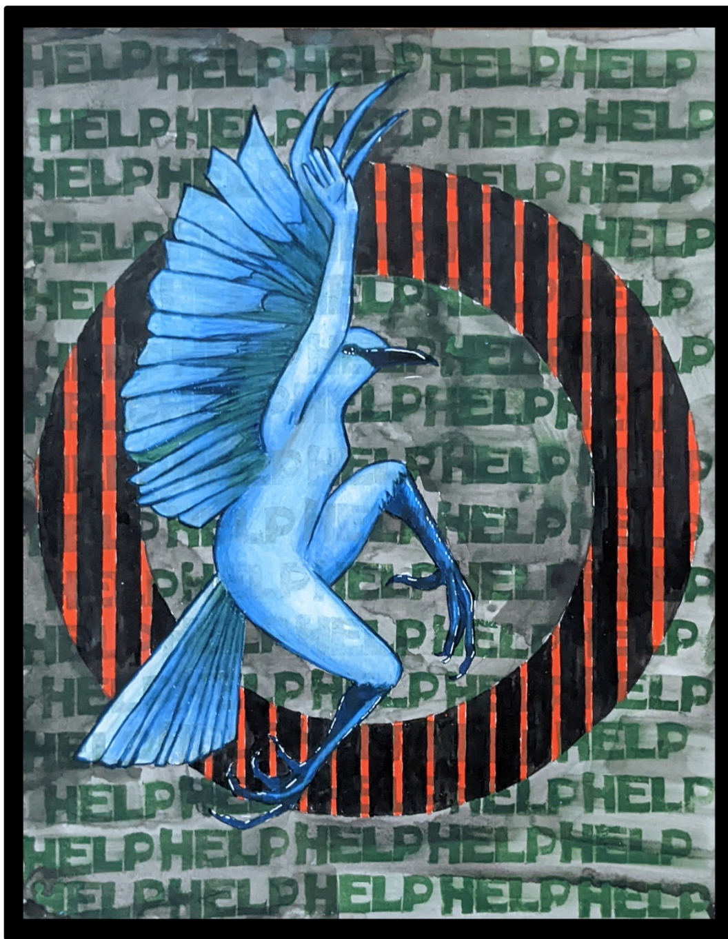
Ember Estridge, Choice, Mixed Media, 11"x14," 2022