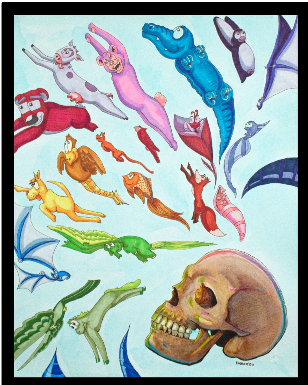
Ember Estridge, Rainbow Meditation , Mixed Media, 18"x 24", 2020