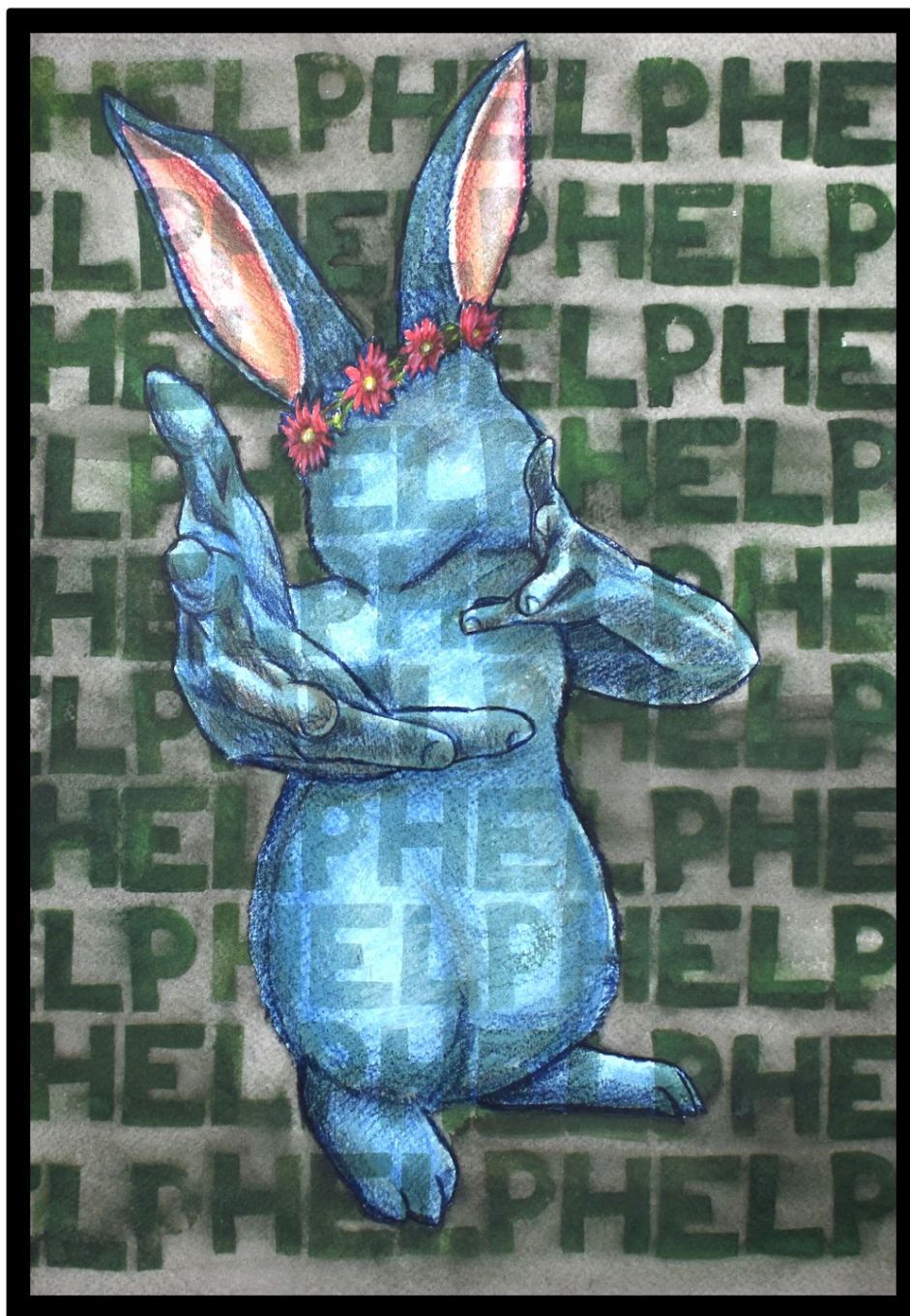
Ember Estridge, Reach , Mixed Media, 12"x 18", 2021