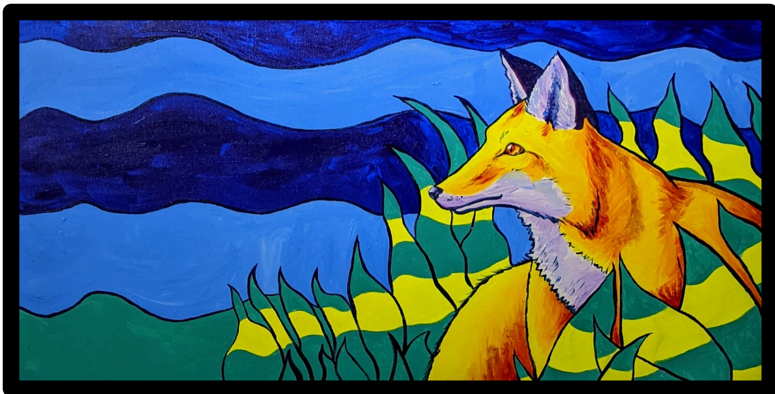
Ember Estridge, The Fox Siren , Acrylic on Canvas, 48"x 24", 2020