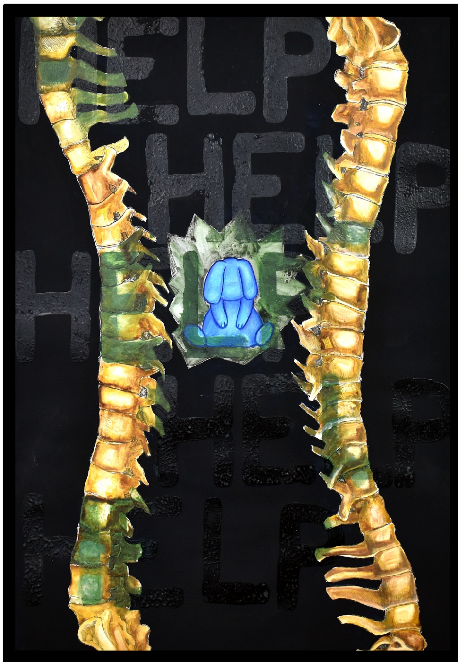
Ember Estridge, Turn , Mixed Media, 18"x 24", 2021