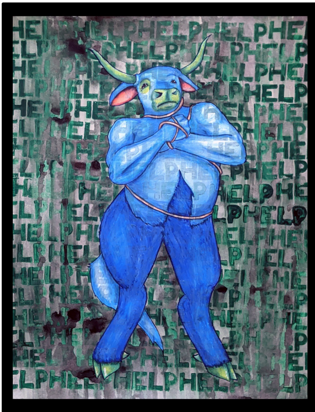
Ember Estridge, Abandon, Mixed Media, 22"x28," 2022